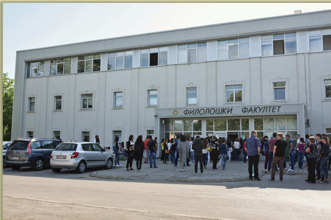
Faculty of Philology, University of Banja Luka

The International Summer School of Serbian Language and Culture at the Faculty of Philology of the University of Banja Luka will take place 16-28 July 2018 .