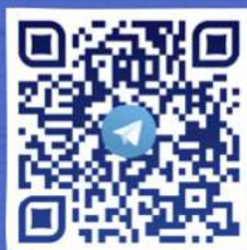
LUNN Telegram (eng)

Join our social nets and messengers with daily updates, as well as a target English-language Telegram-channel. LUNN students have access to a special electronic educational platform, where they can study electronic interactive courses provided by the qualified LUNN faculty. LUNN is a national venue of multilingual inter-civilisation communication «LUNN Boiling Point».