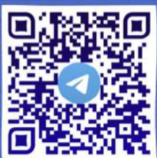
LUNN Telegram (ru)